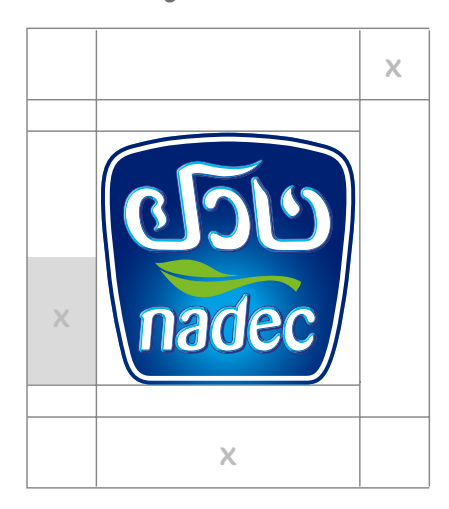
Spacing and isolation on white background