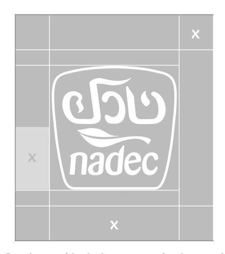
Spacing and isolation on grey background